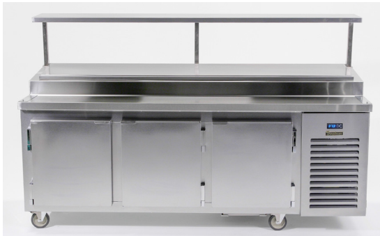
*Shown with optional overshelf