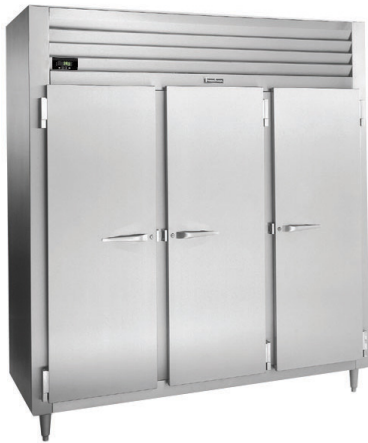
Model Shown Three Section