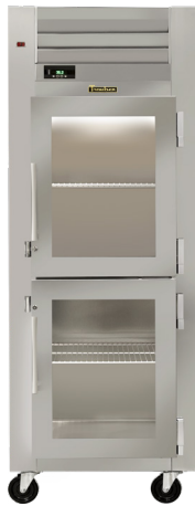
Model Shown One Section (shown with optional interior arrangements & casters)