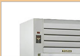
Exterior Mounted Digital Thermometer

Operating at the ideal storage wine temperature of 53-57° F, our Wine Cooler models are specifically designed to encourage the storage and display of fine wine. Traulsen's unique wine racks control sedimentation by reducing vibration. This specially designed wine rack properly tilts bottles, keeping the corks moist and preventing bottle slippage. This also has the added benefit of allowing easy access to all bottles and positioning them for easy label viewing. You can trust Traulsen's quality Wine Cooler models to safely hold your fine wine at proper temperatures.