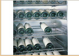
Unique Tilted Wine Racks