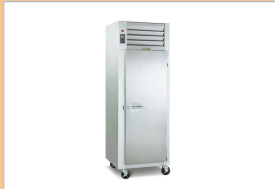
Solid Door Models With Locks